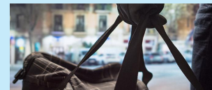
Active Assailant Program