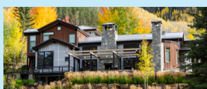
High Value Home Package Program