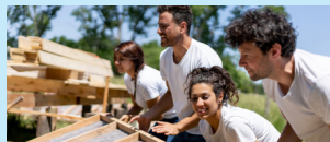
Small Non-Profit Risk Program