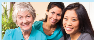
Addiction Treatment Program