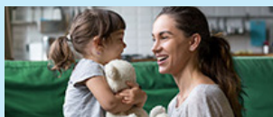
General Social Service Program