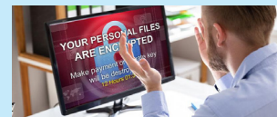
Cyber Liability Program