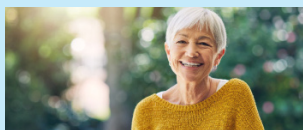
Senior Services Program