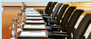
D&O / EPLI Program